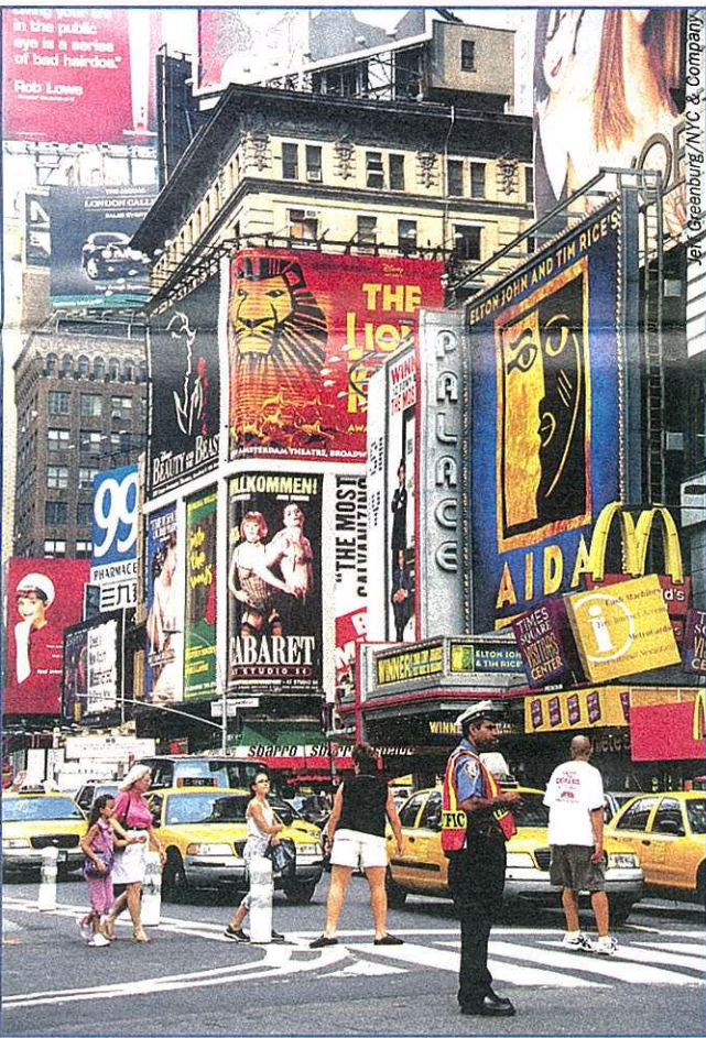
Experience the lights, sounds and charm of Times Square.

Times Square — The epitome of New York charm. You'll be mesmerized by the lights and sounds of larger-than-life advertising, gigantic LCD screens and non-stop action. Times Square is home to Good Morning America , MTV and the NASDAQ studios. Featuring both M&M's and Hershey's stores, it's a chocolate lovers paradise. Kids of all ages delight in the world's largest Toys 'R Us — complete with a full-size Ferris Wheel, Barbie Dream House and Cabbage Patch nursery.